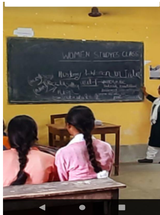
Department of History on history of women