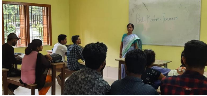
Department of Political Science taking classes on Post-modern Feminism