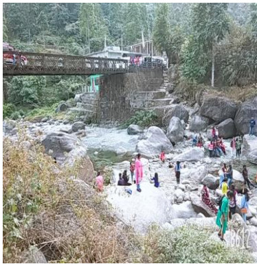
COLLECTION OF AQUATIC PLANTS