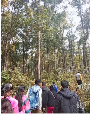
STUDY OF HABITAT