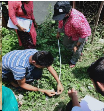
DETERMINATION OF MINIMUM SIZE OF QUADRATE