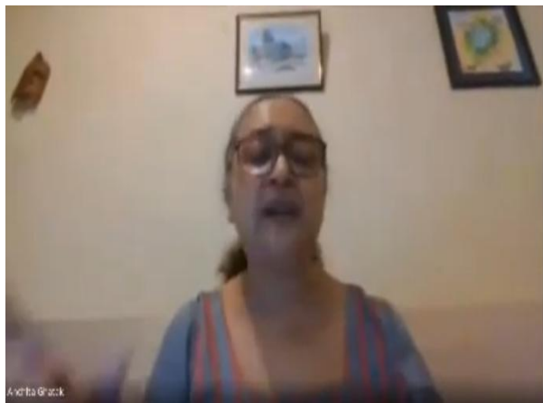
Snapshot of Webinar flyer on women empowerment organized by Women studies cell.