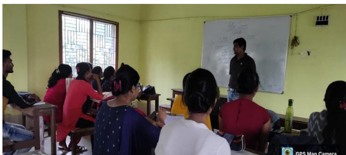
Dept. of Education on women education