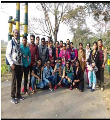
VISIT TO PROTECTED PLACE