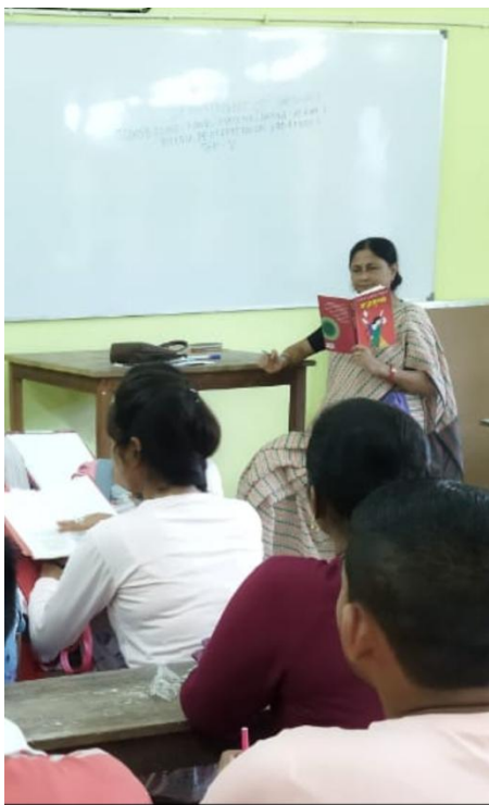
Department of Bengali teaching 'Mayamridanga'