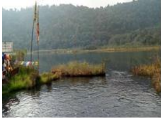
STUDY OF SACRED AQUATIC VEGETATION