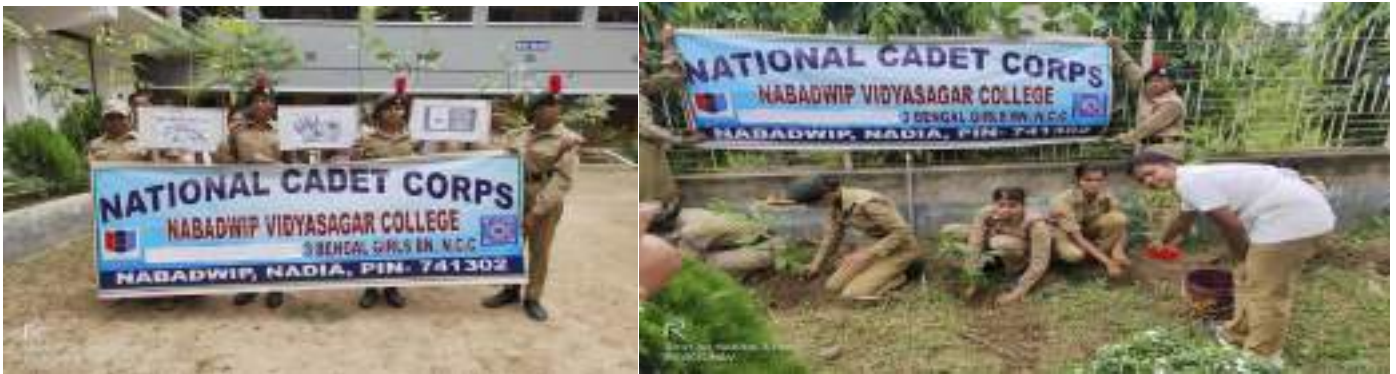
Tree Plantation Programme-2018

To honor our commitment towards mother nature and to augment greenery all around the world. Tree Plantation-day is observed with great enthusiasm and vigor. The year 2018 was no exception. On 21 st March, the NCC of Nabadwip Vidyasagar College joined hands with the teacher and student populace to observe and celebrate that very day. The day before was spent cleaning the campus and the adjacent garden. On an auspicious day the students, led by the NCC cadets went about their task of planting saplings and assuring them protection.