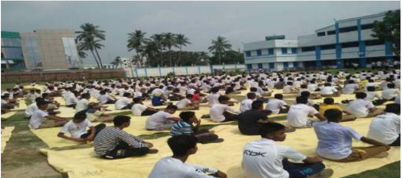
International Yoga day-2019

The wisdom of the ancients lights up the way for future generations. To celebrate that very adage, International Yoga Day. The observation and program were led and orchestrated by the NCC cadets of Nabadwip Vidyasagar College along with the students and faculty. A short introduction to yoga and its benefits was elucidated by eminent speakers. Live demonstrations were given and the instructions for safe practice was also laid out for the participants.