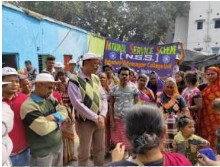
Health awareness camp