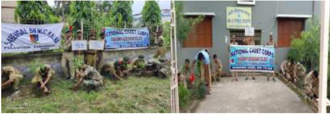
Tree Plantation Programme 2021