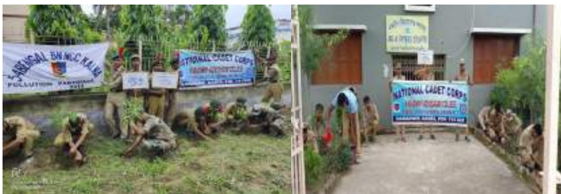
Tree Plantation Programme 2021