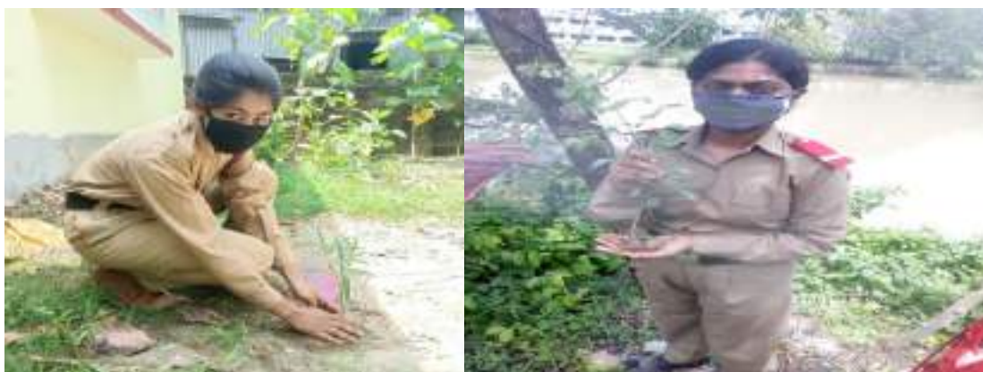
Tree Plantation programme-2021